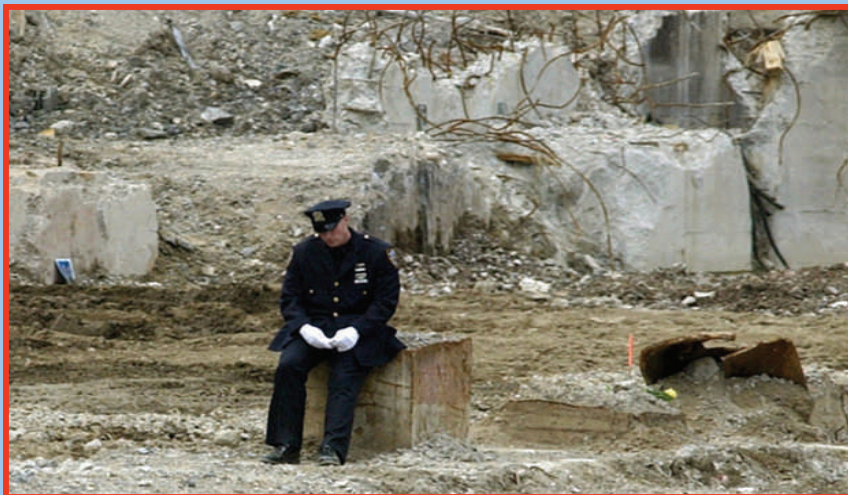
Picture of a police officer sitting in rubble during a ceremony on the 1 year anniversary of the attacks.