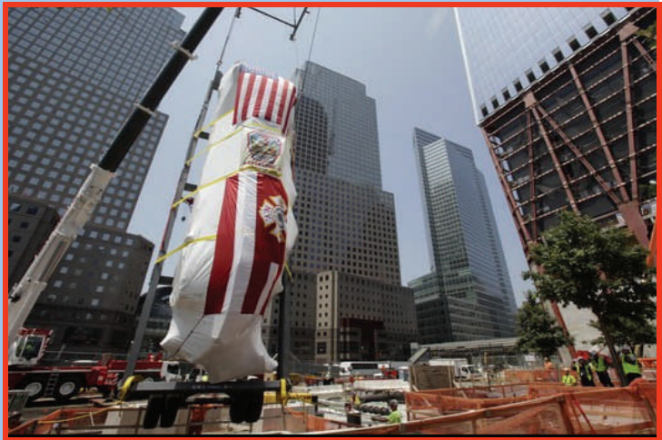
A TV special on "Big Red" showed the FDNY ladder lowered by crane into its final resting place.